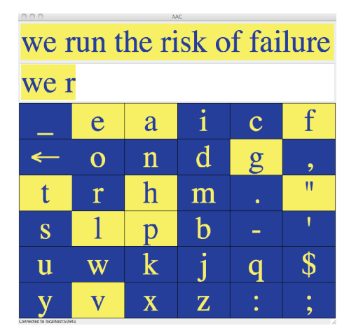
Figure 3. The typing interface presented to participants with and without disabilities during the Huffman scanning paradigm.

(Huffman, 1952). Suppose the partial phrase "His name is Tom Rob" has been typed, and we are using Huffman scanning to type the next letter. The current intended name might continue with an i (e.g., Robinson), an e (Roberts), a b (Robbins), and so on. Or perhaps the previously typed b was an error, hence the current target is the delete symbol. For the sake of illustration, suppose that the probabilities for the most likely symbols are as follows: prob(i) = 0.3; prob(e) = 0.3; prob(b) = 0.2; and prob(delete) = 0.1. The rest of the letters share the remaining 0.1 of probability, summing properly to 1.