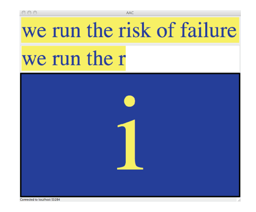
Figure 4. The typing interface presented to participants with and without disabilities during the RSVP paradigm.

There are three stages to the experimental paradigm: training a participant to understand the different scanning tasks, calibrating the scanning rate for each task, and completing the experimental scanning tasks. Participants completed phrase copy tasks with the aforementioned six different scanning paradigms. Participants without disabilities engaged in all six scanning paradigms; GB participated in four of these conditions. Participants were seated at a table in front of a laptop that presented our keyboard emulation software. The participants without disabilities selected targeted symbols by using their dominant hand to hit a Jelly Bean Switch<sup>TM 5</sup> on the tabletop; GB used his chin to depress a Specs switch attached to the Universal Switch Mounting System on his wheelchair.